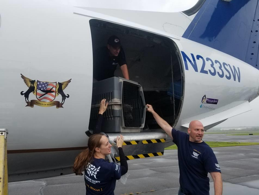
Transport of Harvey Rescue Dogs