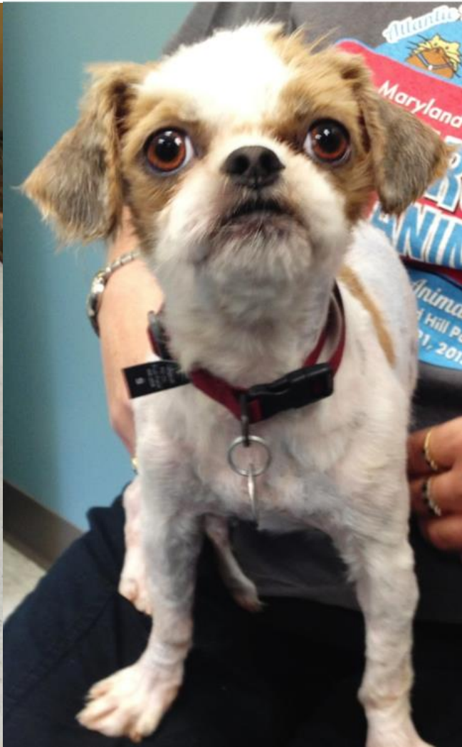
Mrs. Potts needed extra attention and a loving home